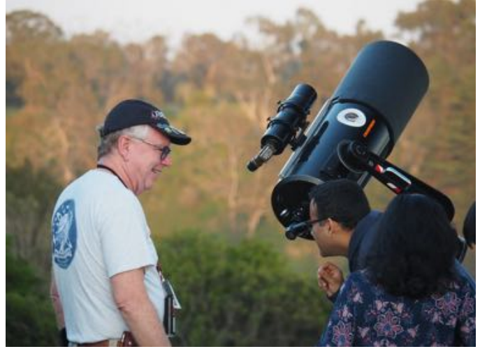
Chuck shares the sky with the public at the Ritz-Carlton Bacara.