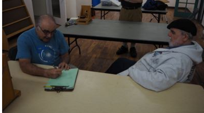
"Run those numbers by me again, Tim. Do you mean to tell me that, if I get up to <u>half the speed of light</u>, I could make it to Aldebaran by New Year's Day?"