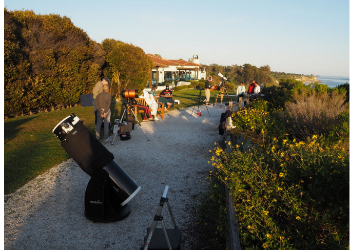
Low light at the Ritz-Carlton Bacara before a club outreach.