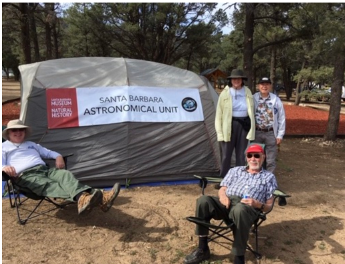
Looking back at an earlier RTMC....