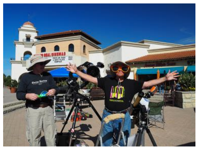
"Beam me up!"