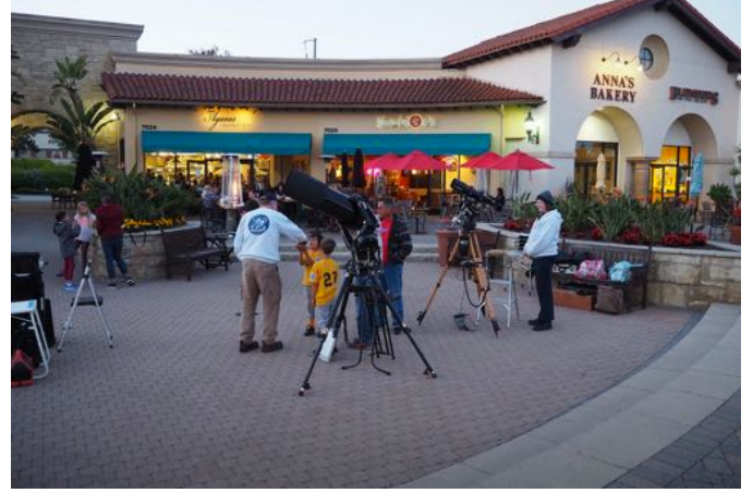
"Don't drop this on your toes or you will walk like a duck!"