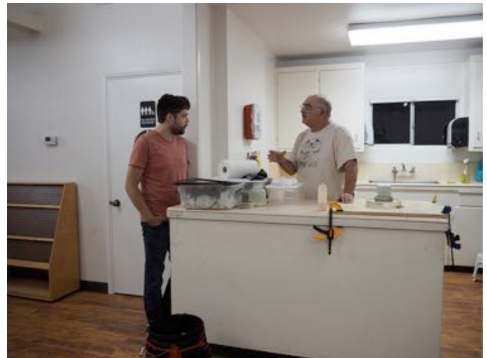
"You know, Sam. I was your age when I started working on this mirror."

I'm writing this out of nostalgia since 2017 is the first CalStar this century I have missed. I hear it was very good - not too hot, but with very good skies. I'll definitely be back next year.